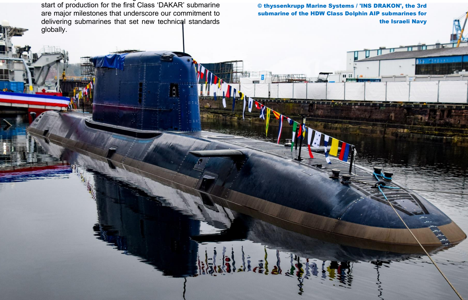
‘INS DRAKON’, the 3rd submarine of the HDW Class Dolphin AIP submarines for the Israeli Navy

Guests from Germany and Israel attended the ceremony, further symbolizing the close ties between the two nations. The launching and naming of ‘INS DRAKON’ represents a key achievement in the production of state-of-the-art AIP submarines, which are globally recognized for their innovation, technical excellence and reliability. The start of production of the first Class ‘DAKAR’ submarine signals the continuation of this success and sets the stage for future collaboration and partnership.